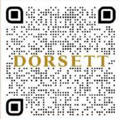
Image used is for illustration purpose only | Rates are in Ringgit Malaysia and are inclusive of prevailing Government Taxes